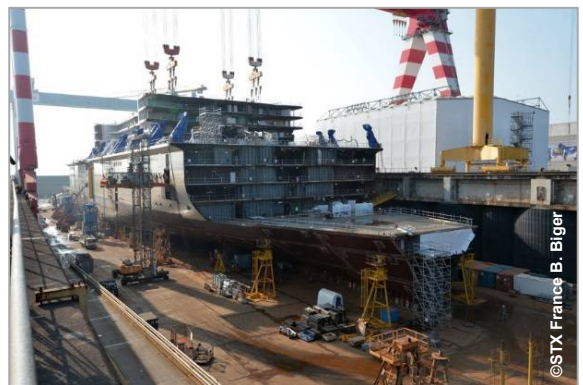
Meraviglia (MSC) during construction phase