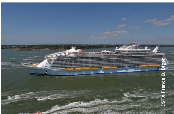
Harmony of the Seas

The contract announced today therefore represents the fifth and sixth ships built by STX France for which ArcelorMittal is the preferred steel supplier. These orders represent a considerable logistical, technological and human challenge for ArcelorMittal's people, taken up by the Gijón, Fos-sur-Mer and Saint-Nazaire plants.