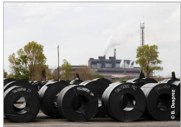
Steel coils on the Fos-sur-Mer site (France)

This new order for two ships will be 100% supplied by ArcelorMittal's European plants : the heavy steel plates that will form the ships' hulls are manufactured at ArcelorMittal's plant in Gijón (Spain), while the decks will be constructed using steel sheet supplied by the Saint-Nazaire facility from coils produced at Fos-sur-Mer (France). Initial deliveries of these products began in September and the ceremony for the cutting of the first plate was held at the STX France shipyard in St Nazaire on 21 November, marking